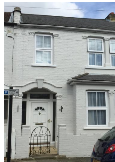
8 Percy Road, Isleworth in 2015