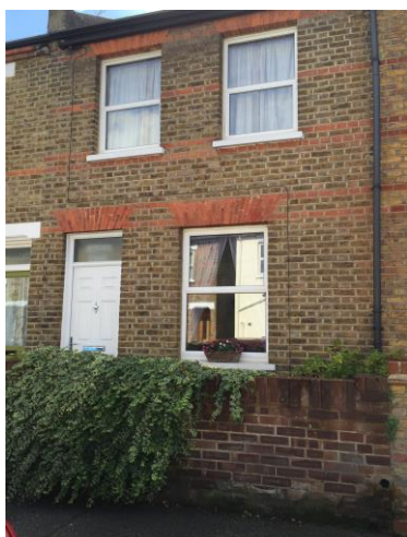
37 Napier Road, Isleworth in 2015