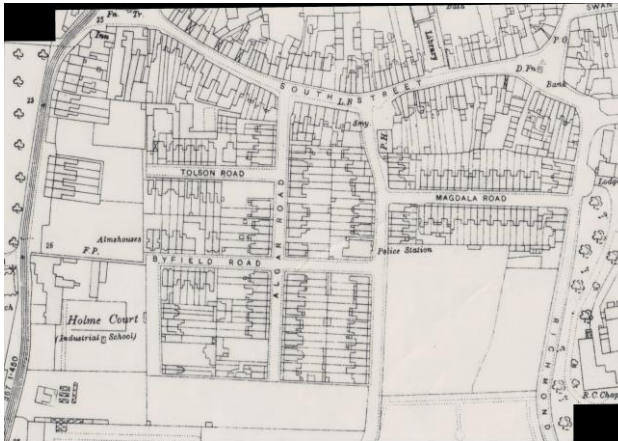
Magdala Road, off Worple Road, Isleworth c1915 Ordnance Survey Map