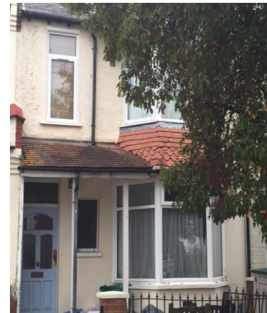
18 Highfield Road, Isleworth in 2015