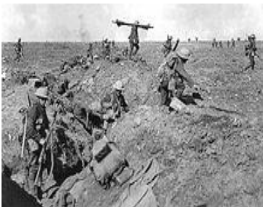
British troops advancing in support during the Battle of Morval, Somme: 25 th September 1916.