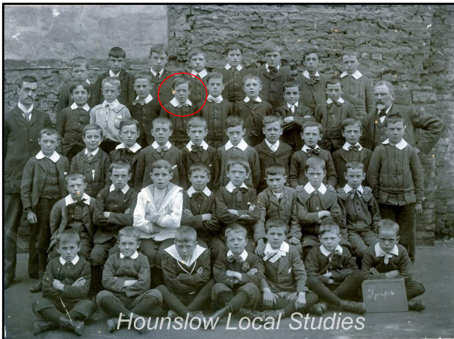
Isleworth Blue School, Group 4, c 1905.