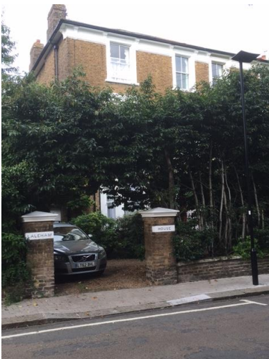
Laleham House, Woodlands Grove, Isleworth, in 2015, recorded as the Trembath family home in the 1901 and 1911 census