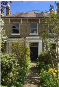
Left:-Springmere, 20 Ailsa Road in 2016 Below:- the Ailsa Road area in 1914