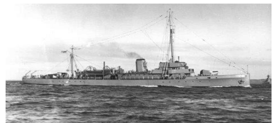
HMS Penarth, Minesweeper

Certificate included with the permission of the CWGC