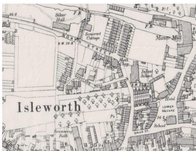
Lower Square Isleworth and the surrounding area C 1894 Ordnance Survey map