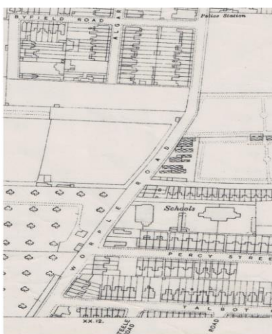
Worple Road, Isleworth, C 1915 Ordnance Survey map. 20 Worple road would have been one of the houses where the present Kings Terrace stands.