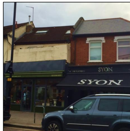
23 St John's Rd, Isleworth 2015-left of Syon Cafe