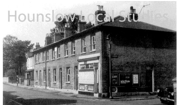
Above : 1894 Ordnance Survey map of North Street and Percy Gardens Top right: 1-5 Percy Gardens, c1960. Below: Claud Pink headstone in Isleworth Cemetery.