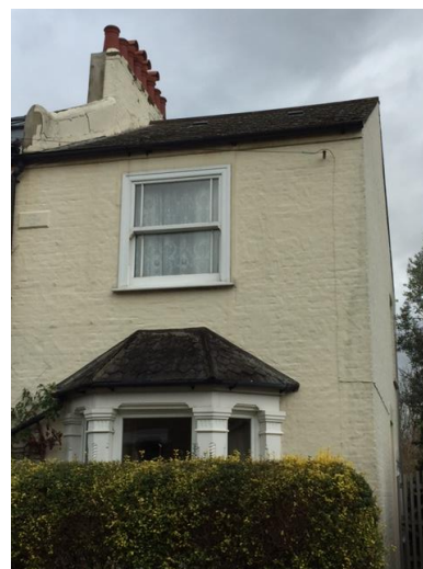
Rose Cottage, 48 Eve Road, Isleworth in 2016