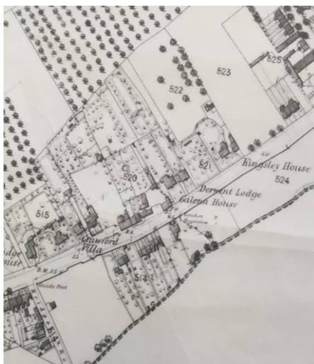
Kingsley House, London Road Isleworth in 1865.