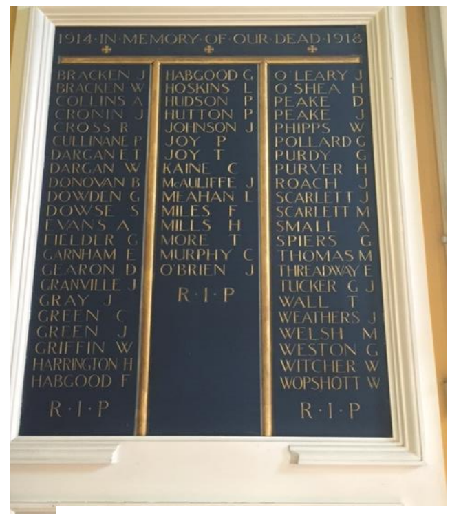
St Bridget's Memorial, Isleworth