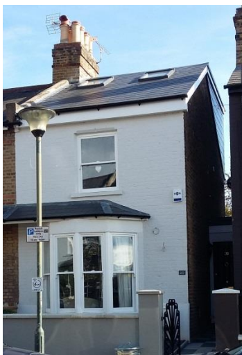
20 Haliburton Road, Twickenham