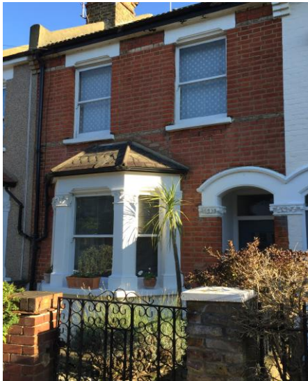
Below: 24 Newry Road. 2016