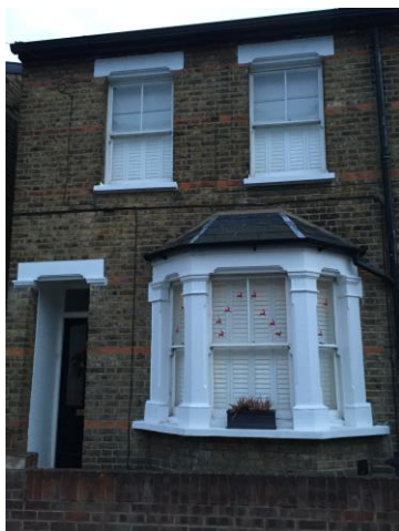
98 Worples Road in 2015