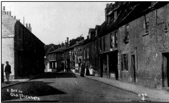
North Street from Swan Street, c1905

In 1896 four of the children were baptised at All Saints on the same day. Their address was 3 Percy Gardens, North Street, and later 23 North Street (which may have been the same house after new street numbering came in). North Street and Percy Gardens looked very different then from today.