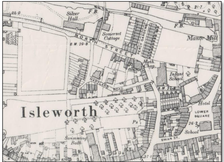
1894 Ordnance Survey map