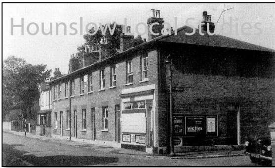
1-5 Percy Gardens, c1960

In 1896 four of the children were baptised at All Saints on the same day. Their address was 3 Percy Gardens, North Street, and later 23 North Street (which may have been the same house after new street numbering came in). North Street and Percy Gardens looked very different then from today.