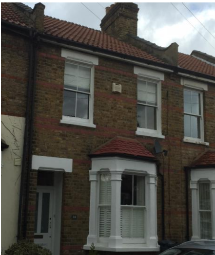
14 Napier Road, Isleworth in 2016