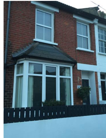
62 Talbot Road in 2015