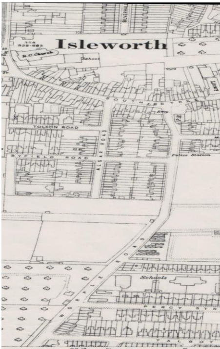
Isleworth c1915, showing part of Magdala Road, South of South Street and east of Worple Road