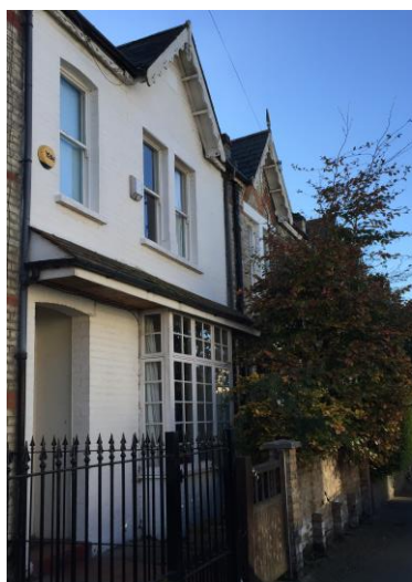
16 Northcote Road in 2016