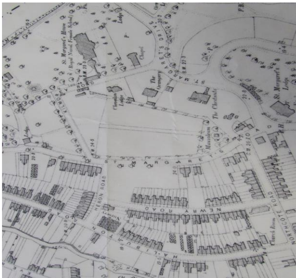
The Chestnuts and surrounding area in 1894-6 Ordnance Survey