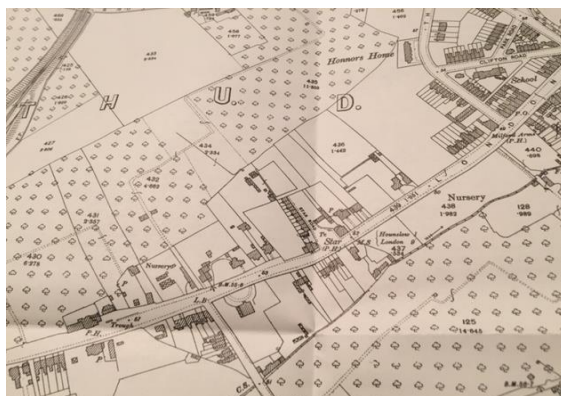
Star Public House on London Road C1894 Ordnance Survey Map