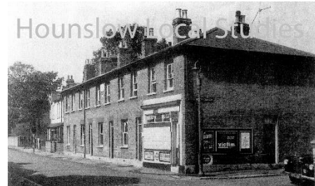
The start of Percy Gardens from North Street c1960