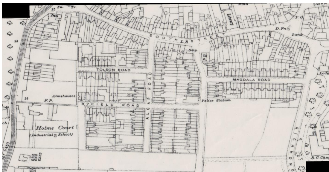
Above:- Magdala Road and the surrounding areas. Ordnance Survey map C 1915