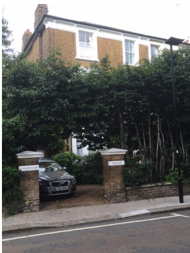
Laleham House, Woodlands Grove, Isleworth, in 2015, recorded as the Trembath family home in the 1901 and 1911 census