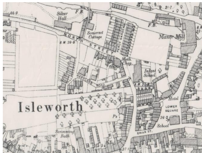
Lower Square Isleworth and the surrounding area C 1894 Ordnance Survey map