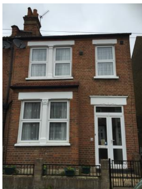
24 Percy Road Isleworth in 2016