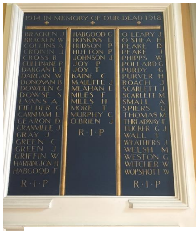
St Bridget's Memorial, Isleworth