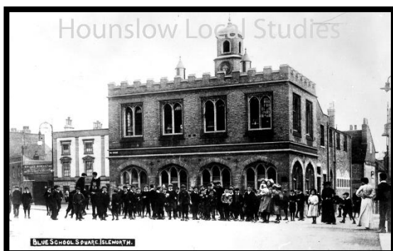
The Blue School C1903