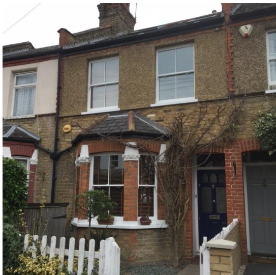
19 Silverhall Street Isleworth in 2016