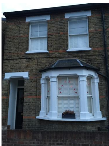
98 Worples Road in 2015