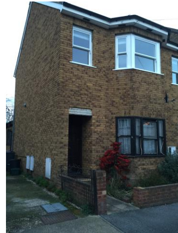
77 Talbot Road in 2015