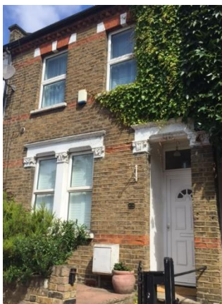
434 London Road Isleworth in 2016