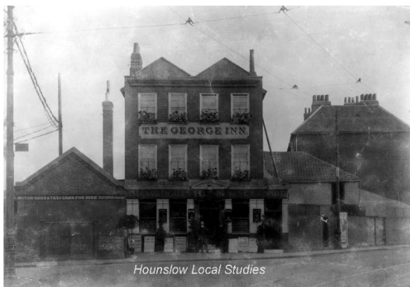
The George Inn, South Street Isleworth 1900-1914.