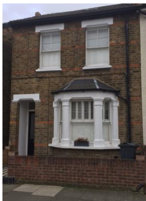
98 Worple Road, Isleworth 2016