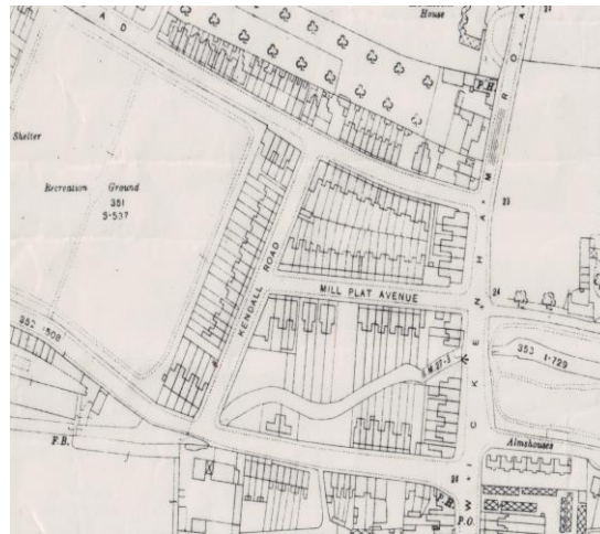
Mill Platt Avenue c 1915 Ordnance Survey map Below 21 Mill Platt Avenue, Isleworth 2015