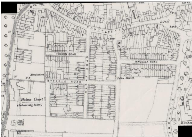
Magdala Road, off Worple Road, Isleworth c1915 Ordnance Survey Map