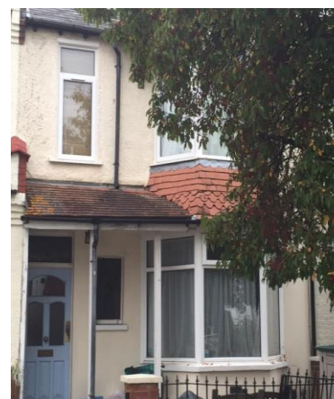
18 Highfield Road, Isleworth in 2015