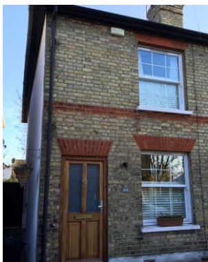
44 Algar Rd, 2015