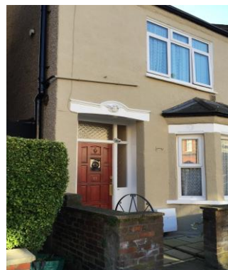
11 Percy Road, 2015