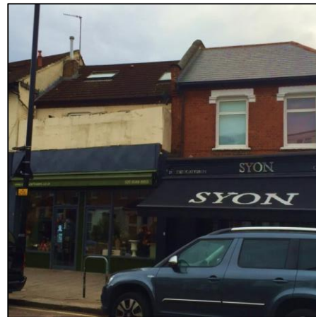
23 St John's Rd, Isleworth 2015-left of Syon Cafe