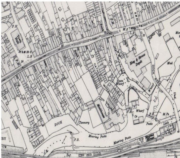
c1915 Ordnance Survey Map- Catherine Wheel Yard, Brentford