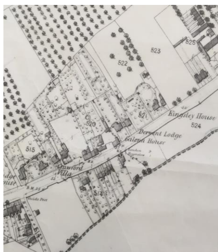
Kingsley House, London Road Isleworth in 1865.