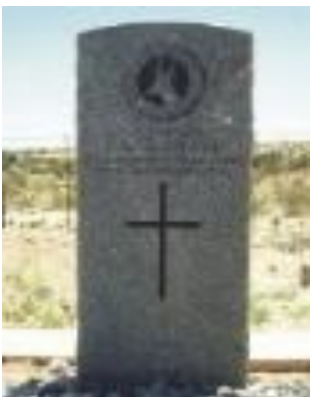
James Antill Aldridge's headstone and grave in Warmbad, Namibia, courtesy of South Africa War Graves Project